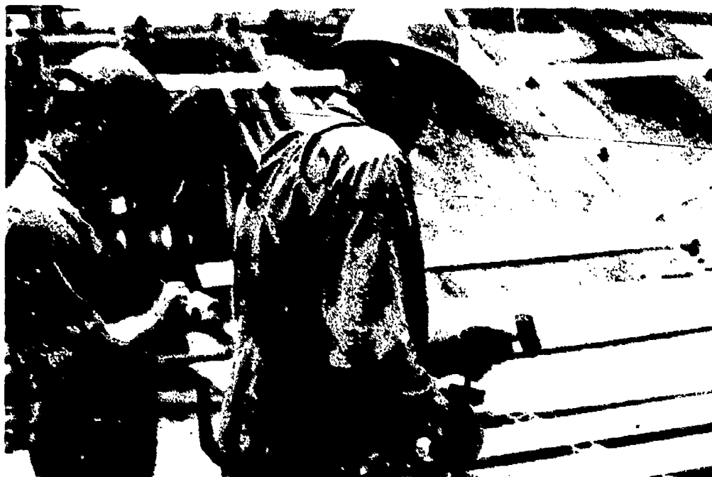
Lumber Grading at Weyerhaeuser

The training program conducted at Bruce, Mississippi for Weyerhaeuser's Southern Pine Sawmill was three weeks in length and covered 36 hours of instruction. All classes were held at night. People who desired training for the forest products industry filed an application with the area office of the Mississippi Employment Service. Personnel in this office interviewed, screened, and referred applicants to the training program. One week of orientation instruction was conducted in the Bruce High School Auditorium. The remaining two weeks of training were conducted at the Weyerhaeuser Mill. The instructional content included company information, raw materials base, terminology, manufacturing processes, units of measurement, grading, safety and first aid, and detailed hands-on experiences in equipment operation.