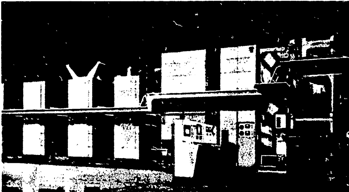
Modern Printing Press

Milwaukee Electric Tool Corporation began manufacturing portable electric power tools in its Jackson plant early in 1974. A smooth start-up of this plant was assured after machine tool operators and assemblers were trained at the Jackson branch of Hinds Junior College. Training programs were offered at night on two different occasions. The first program focused on the knowledge and skills required for machining aluminum castings. Candidate employees learned from industry instructors how to perform machine operations on specialized equipment furnished to the school by the industry. The second program stressed machining of steel parts and assembling electric power tools. Participants in both programs were cross-trained in multiple content areas. Each class period was structured so that the participants received one hour of instruction in three different areas each night. The instruction was tailored specifically to industry needs and included the following content areas: precision measurement, safety, blueprint reading, parts and equipment identification, and cutting and assembly tools. The Jackson office of the State Employment Service counseled each person regarding training and job opportunities, notified the candidates of the date and place of training, and notified them of the availability of employment after completion of the program.