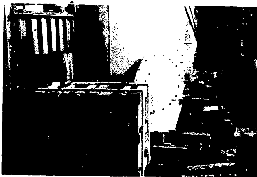
16,000 lbs. Circuit Breakers Ready for Shipping by Rail

The Jackson branch of Hinds Junior College was the site for training assemblers for the Power Breaker Division of Allis-Chalmers. This program was arranged in two phases: (1) a broad orientation to the circuit breaker industry, and (2) intensive skill preparation. A 140-hour program of instruction over a period of 7 weeks was provided for a day class and an evening class. After completing the orientation, three groups were formed for specialized instruction in light assembly, heavy assembly, and electrical wiring. Supervisors from the circuit breaker industry were employed by Hinds Junior College to provide detailed skill preparation instruction. Two additional instructors provided one hour of supplementary training each day in blueprint reading and safety. Training materials, such as circuit breaker parts and assemblies, were furnished by the industry. Orientation programs were also provided for machine tool operators, welders, and drafting and design personnel.